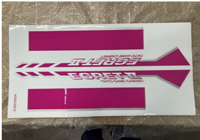
G1501350B BODY STICKER SHEET