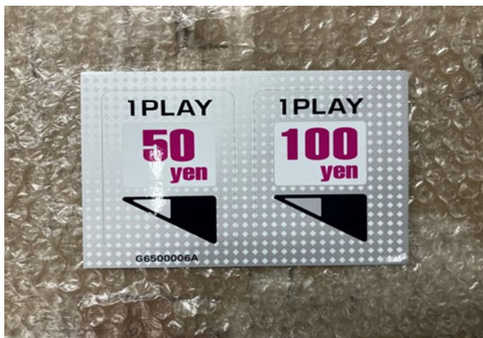
G6500006B PRICE STICKER SHEET