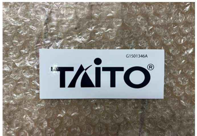
G1501346A TAITO STICKER SHEET