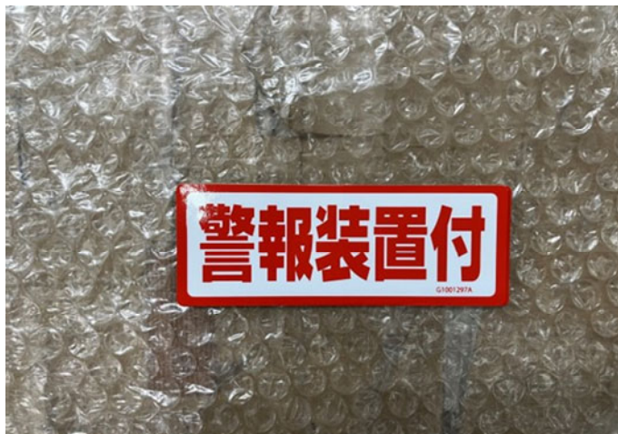
G1001297A CAUTION STICKER