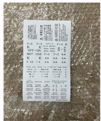
G1001324A CABINET STICKER SHEET